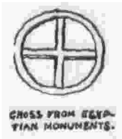
CROSS FROM EGYPTIAN MONUMENTS.